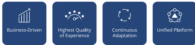
Figure 1: Forward-thinking executives choose the Aruba EdgeConnect SD-WAN platform

With more than 2,000 production deployments, customers have identified four unique areas of business value as the reasons they've chosen the Aruba EdgeConnect unified SD-WAN platform. The platform enables customers to build a unified WAN edge that is business-driven, delivers the highest quality of experience, continuously adapts to changing business needs and network conditions. It is designed to enable enterprises to fully realize the transformational promise of the cloud.